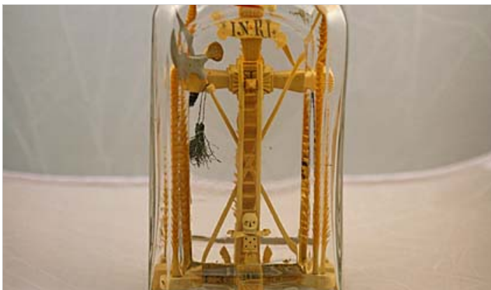
A crucifixion in a bottle, made by a Russian prisoner of war