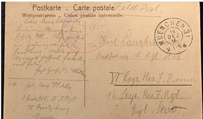
Written from Nuremberg, the postcard suggests Hitler had dental tribulations